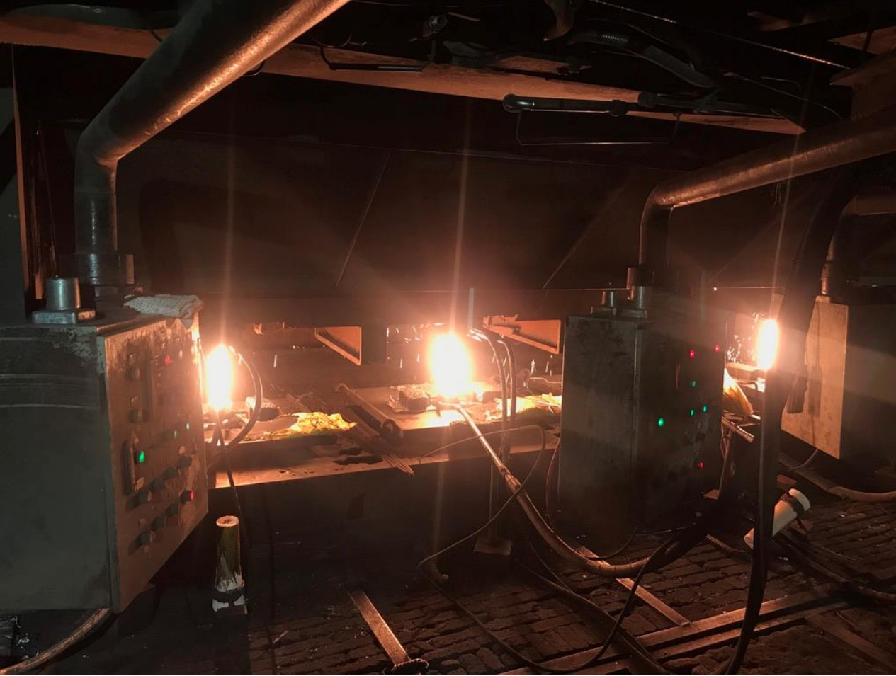
From EAF thru Copper Mold