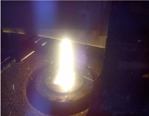
Steel Casting Mold made from Copper.