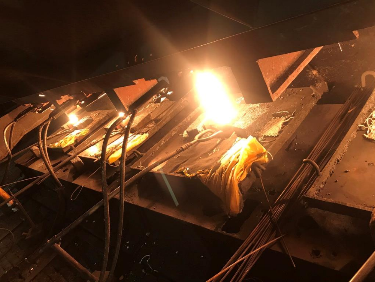
Casting to be Billet.